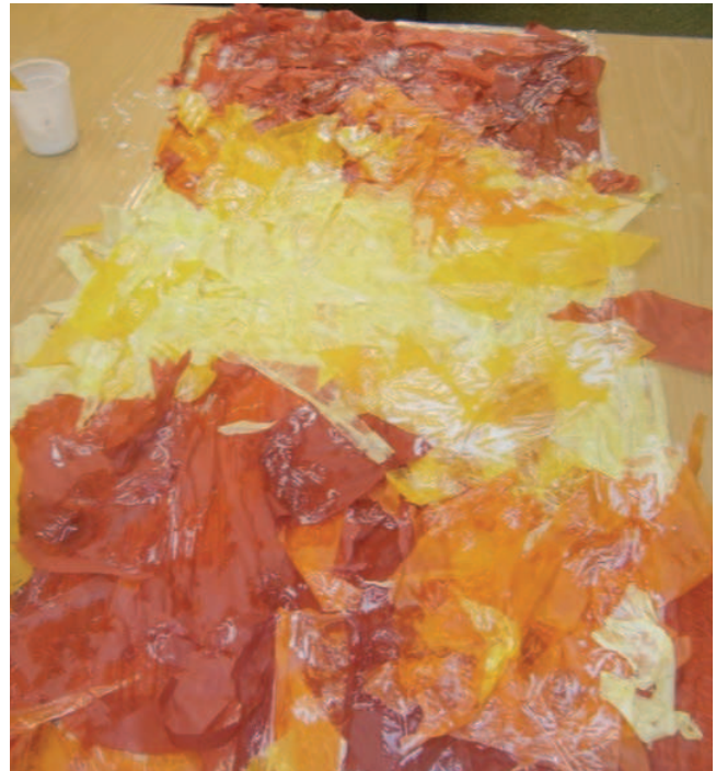
Holi - A Hindu Festival of colour

We looked at the way Muslims use colour and pattern to show how they think about God. We made our own pattern designs